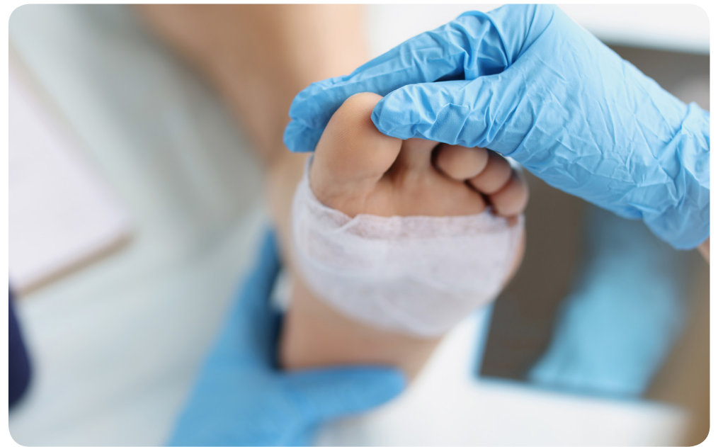
Podiatry Service - Metatarsalgia

Surgical options may include soft tissue correction or nerve excision or bony procedures depending on the cause of the symptoms. There are complications associated with surgery including swelling, infection, scar sensitivity and recurrence.