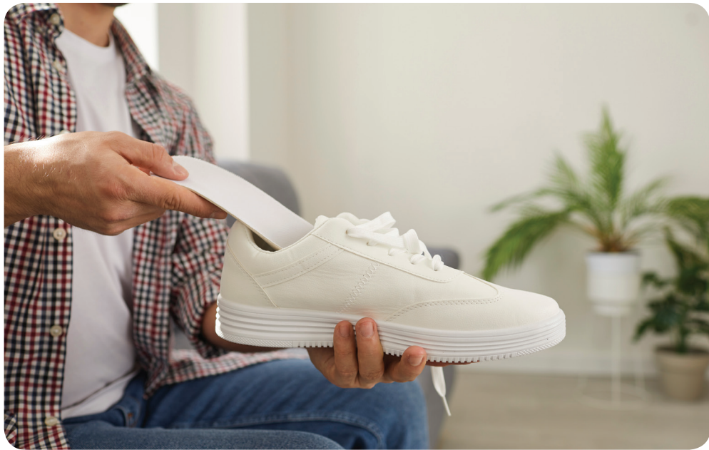
Podiatry Service - Metatarsalgia

Footwear is key to managing pain in the front of your foot. You should wear good quality, supportive footwear with sufficient length, width and depth for your toes. Ensure the footwear have sufficient length and width of the shoe and sufficient space over the top of your toes to accommodate your foot. When purchasing new footwear, be mindful to measure your shoes to accommodate your longest toe (which is not always the big toe).