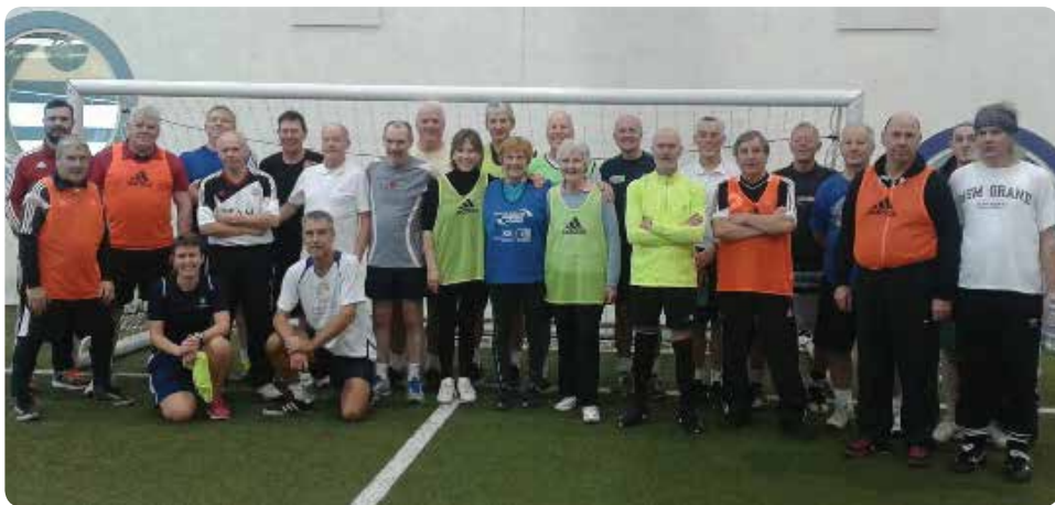
Walking football helps people to feel fitter and make new friends.