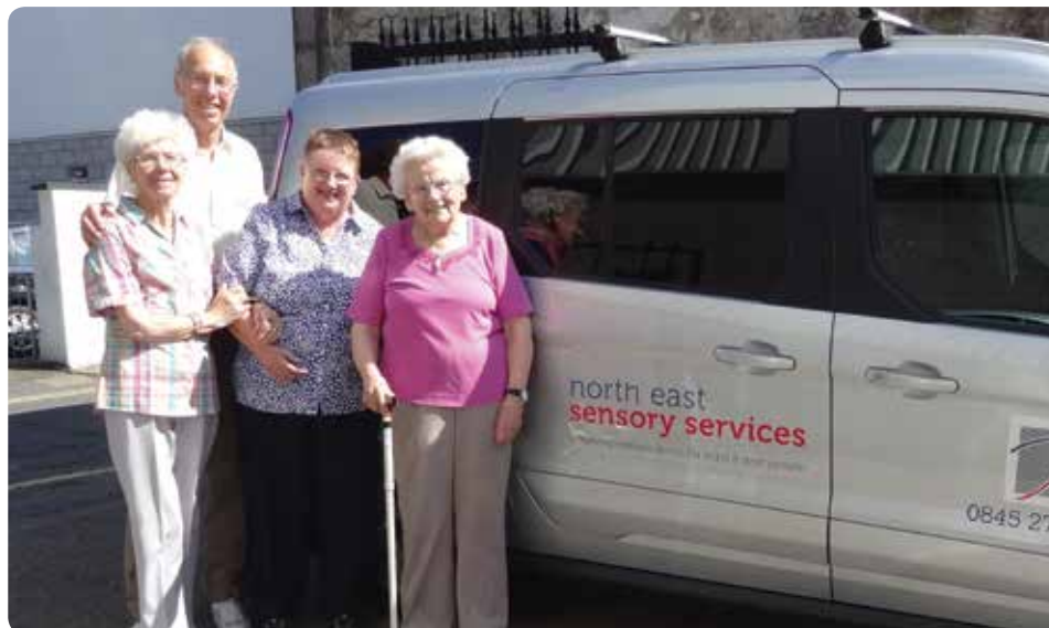
Volunteer drivers help service users attend social groups in Aberdeen.

If you would like to get involved, or find out more, please get in touch with our Public Involvement Team, either by emailing nhsg.involve@nhs.net or by phoning 01224 558098.